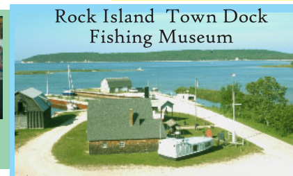
Rock Island Town Dock Fishing Museum