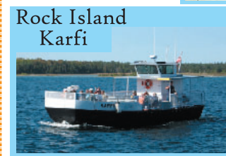
Rock Island Karfi