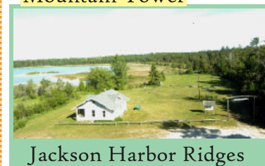
Jackson Harbor Ridges