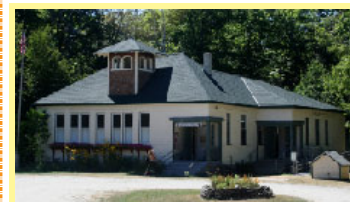
Art and Nature Center