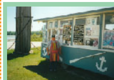
Time Out concession stand